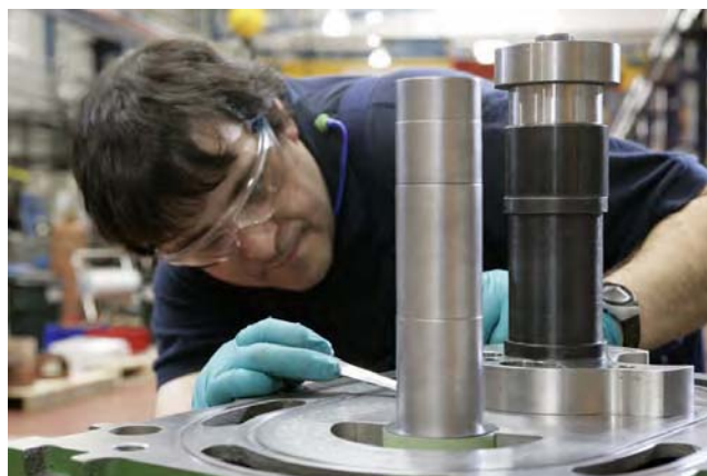
Figure 1: Trained service technician repairing an Edwards pump at a national plant.

When products require more than just routine maintenance and you want the confidence afforded by the quality and standard of repair only the OEM can guarantee, then choose from our range of product repair and overhaul services. Edwards offers fixed price servicing for swift response and simple budgeting, or a flexible pricing structure for maximum cost control.