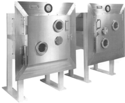
Stokes Model 438 Vacuum Shelf Dryer

Edwards has over 90 years experience in the design of dryers for the chemical, pharmaceutical, plastics and metallurgical industries and has pioneered the design of heated shelves for vacuum shelf dryers.